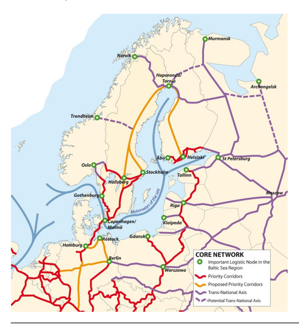
Figure 2: Existing and proposed railway core network corridors and main nodes.

We also stress the importance of third country port nodes to be included in the core network, such as Trondheim and Narvik.